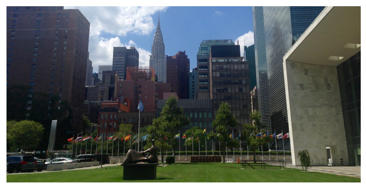
UN, NEW YORK: The creation of this subcommittee in the United Nations System is the first for UN-GGIM.