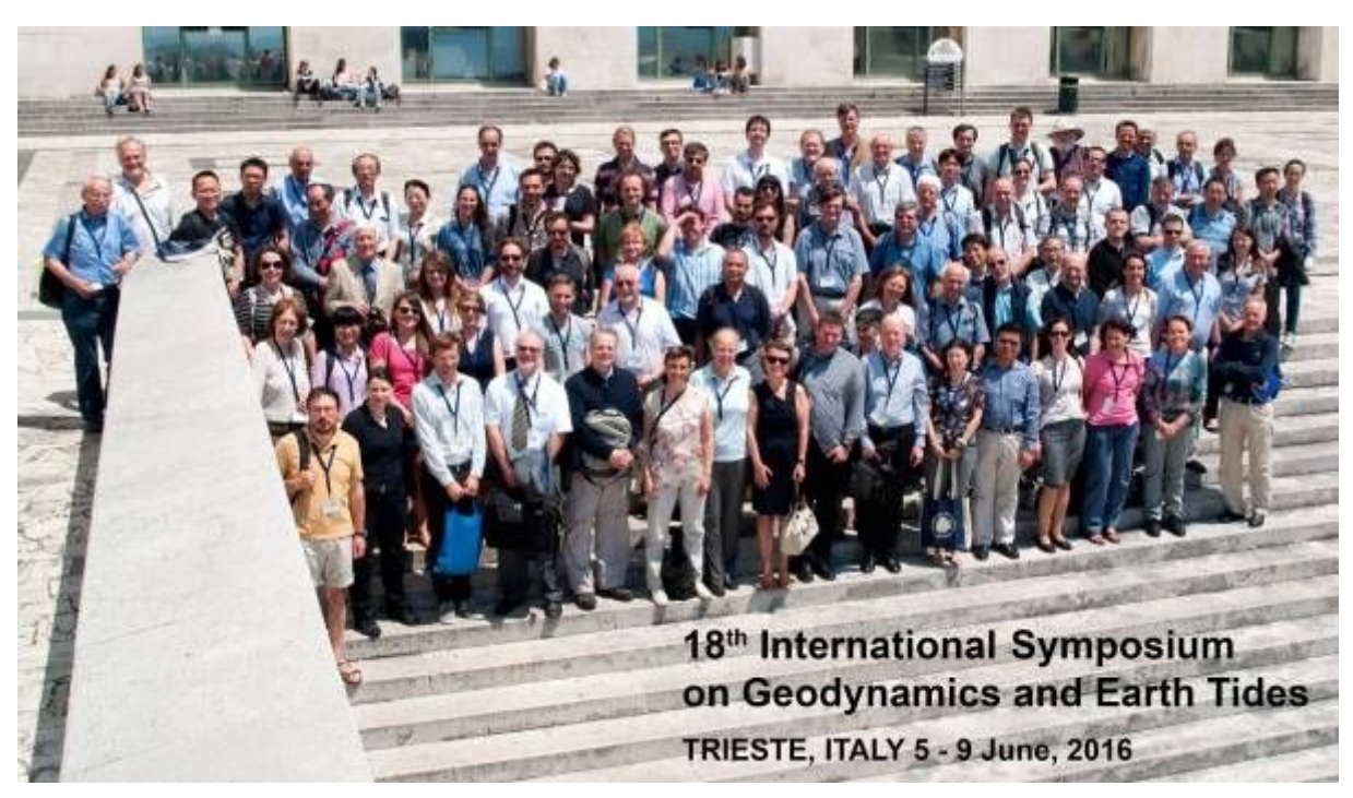
Group photo of participants

Link to the meeting homepage: <a href="http://g-et2016.units.it/">http://g-et2016.units.it/</a>