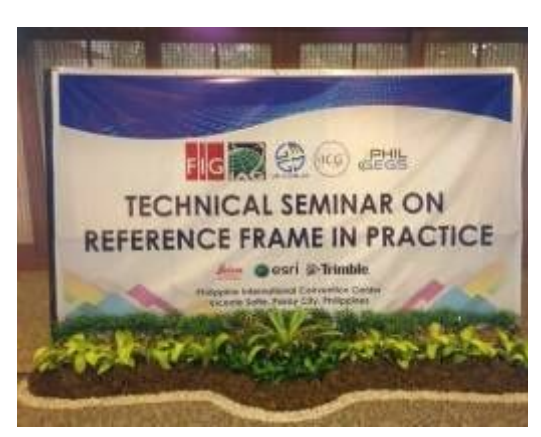
Reference Frame in Practice Workshop

SEASC website: http://www.seasc2013.org.ph