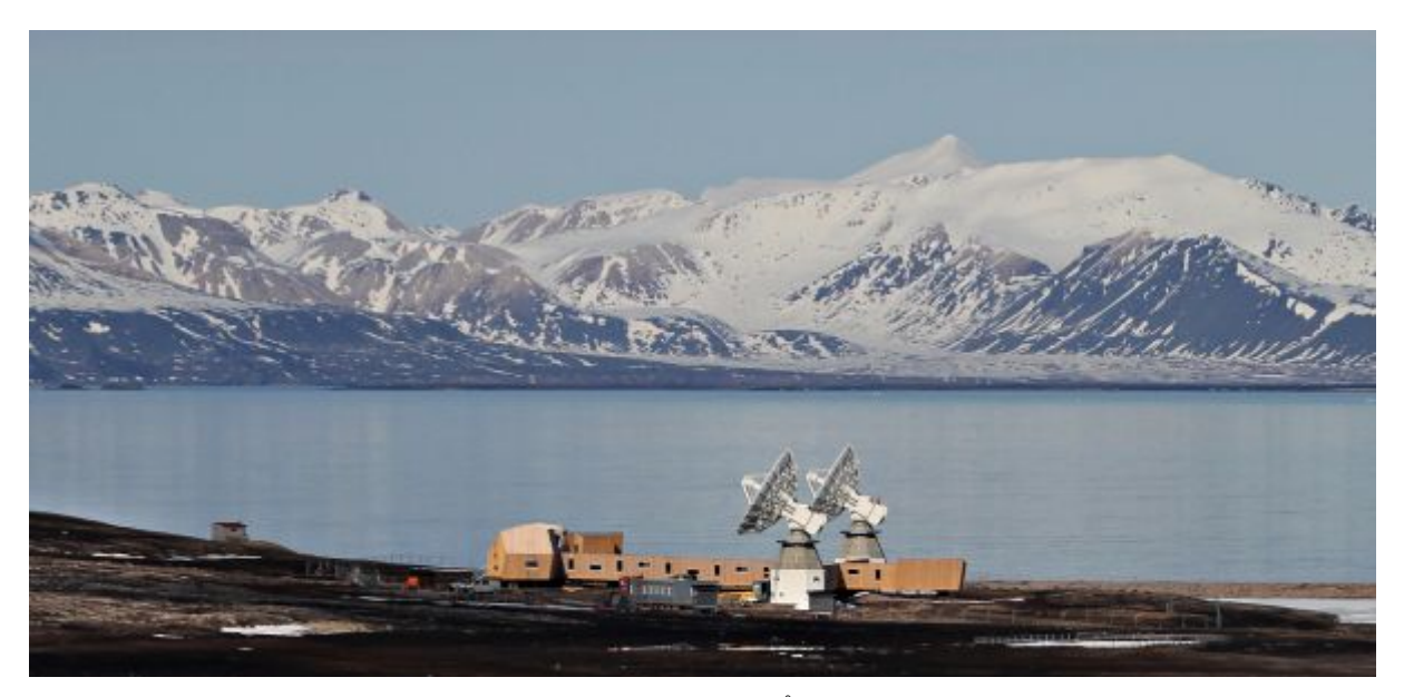
NEW: How the NMA's new Geodetic Earth Observatory at Ny-Ålesund now looks.

The new geodetic Earth observatory being built by the Norwegian Mapping Authority (NMA) at Ny-Ålesund on Svalbard will soon be complete. Installation of the new antennas was finished at record speed this spring.