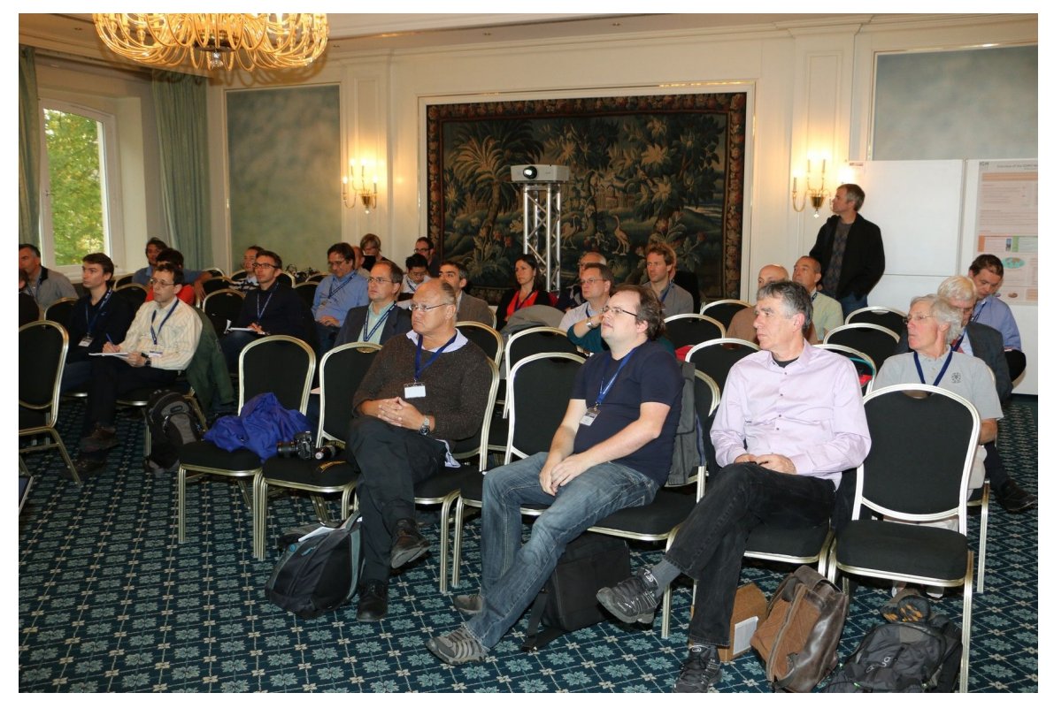
Some participants at the IDS Workshop