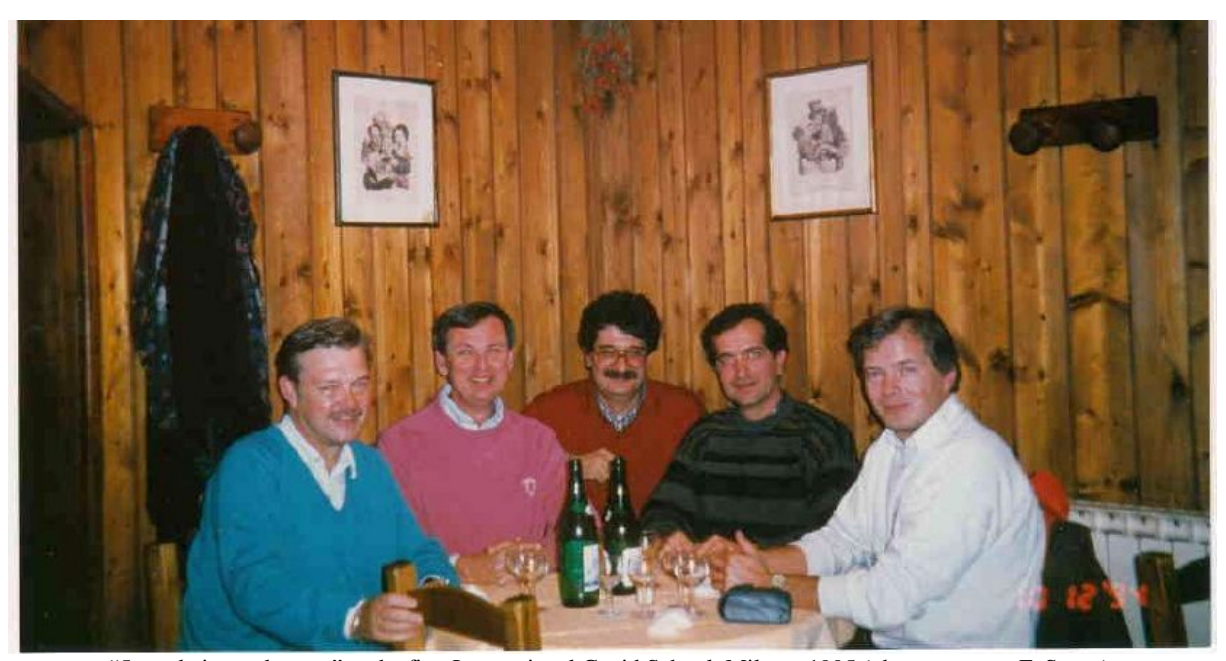
"5 geodetic musketeers" at the first International Geoid School, Milano, 1995 (photo courtesy F. Sanso).