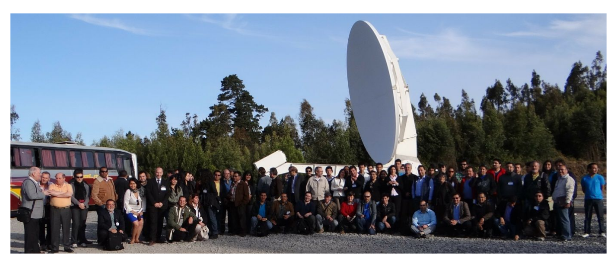
Attendees of the SIRGAS General Meeting 2012, Concepción, Chile, October 29 to 31, 2012.

The main conclusions of the meeting may be summarized as follow: