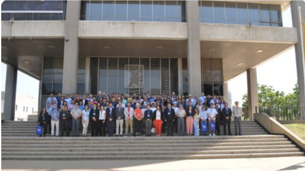
Participants of the SIRGAS 2022 Symposium, IGM-Chile, Santiago, Chile, November 7th to 9th, 2022

The technical sessions of the symposium had the contribution of 59 presentations from the following countries: Germany, Argentina, Canada, United States, Costa Rica, Colombia, Brazil, Ecuador, Bolivia, Chile and Uruguay. There was an attendance average of 90 participants onsite and 130 as remote. All Symposium presentations' are available at https://app.ign.gob.pe/simposio/programacion/ .