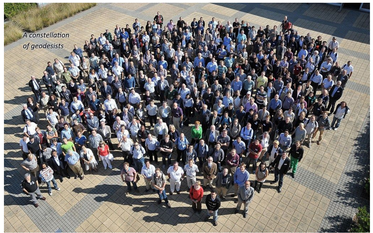
Some participants at the 2013 Scientific Assembly in Potsdam, Germany, celebrating 150 years of the founding of the IAG