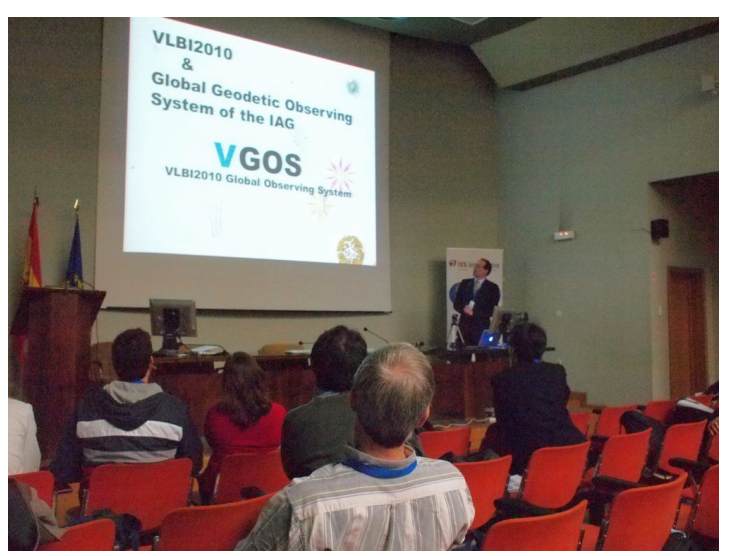
Launch of VGOS at the 7th IVS General Meeting