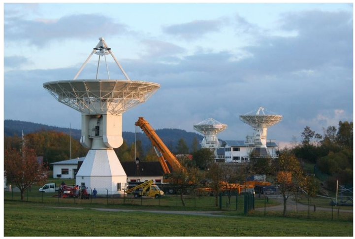
A new VGOS station: The Twin Telescope Wettzell

shown that the VLBI2010 Global Observing System can outperform the past observations by almost an order of magnitude. VGOS will be the VLBI component of the Global Geodetic Observing System (GGOS).