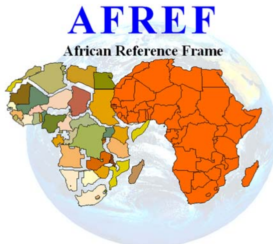
Figure 2: AFREF logo launched at the technical workshop held in July 2006

Although the ideals and concepts of AFREF have been debated for a number of years, the scientific and technical aspects of the project had never been highlighted in a dedicated workshop. The possibility of South Africa hosting such a technical workshop was raised at a United Nations Office for Outer Space Affairs (UNOOSA) meeting in Vienna in December 2004. A small Local Organising Committee was constituted and the University of Cape Town was selected as the most appropriate venue. The workshop was initially planned for January / February 2006 but, because of insufficient funding at the time, was postponed to July 2006. The University of Cape Town and the Chief Directorate: Surveying and Mapping jointly organised the first AFREF Technical Workshop in July 2006, relating to the establishment of the African Geodetic Reference Frame. Delegates from 24 countries attended. 38 representatives from 17 countries with a good geographical distribution throughout Africa were represented at the workshop. 4 representatives from 2 of the 3 regional centres for mapping in Africa also participated in the workshop viz. the Regional Centre for Mapping of Resources for Development (RCMRD) based in Kenya and the Regional Centre for Training in Aerospace Surveys (RECTAS) based in Nigeria. In addition to the above representatives from Africa, 15 speakers from a number of organisations outside of Africa gave presentations.